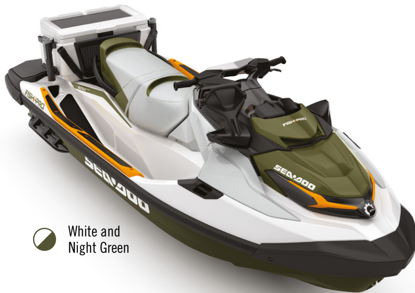
White and Night Green